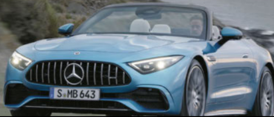
European image shown.